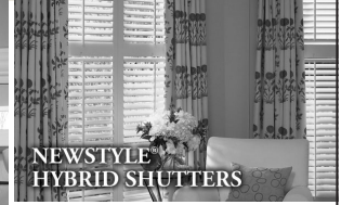
NEWSTYLE HYBRID SHUTTERS