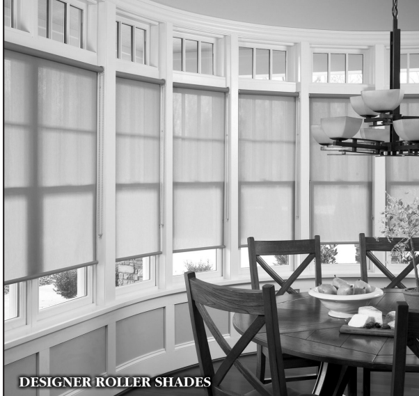
DESIGNER ROLLER SHADES