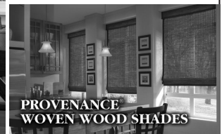
PROVENANCE WOVEN WOOD SHADES

HunterDouglas Hunter Douglas lets you control light. Beautifully.