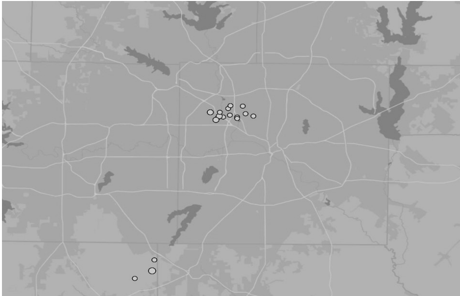
Map of earthquakes in the Dallas Metroplex since March 10, 2015. The size of the dot, reflects the relative intensity of the quake. The cluster northwest of Dallas is centered near Irving, Texas, while the cluster southwest is centered near Venus, Texas.