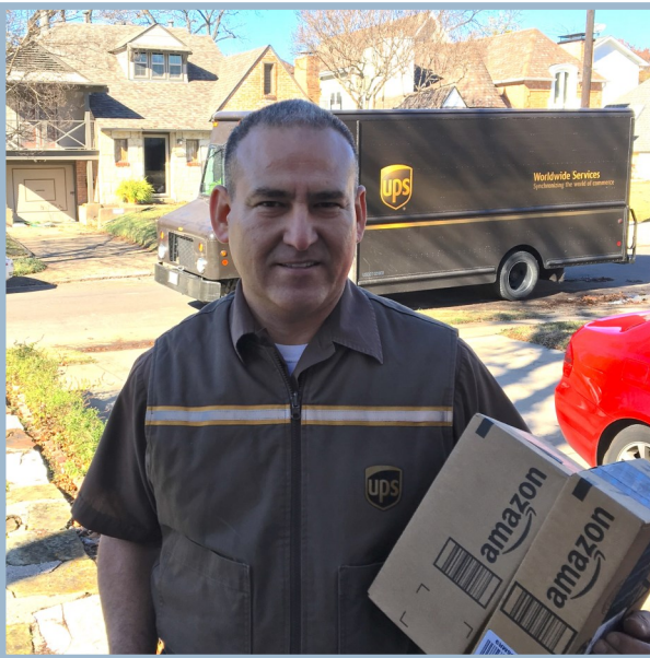
Cruz stops by to deliver packages on Milam Street

With the holidays right around the corner, we are sure to see more of our friendly