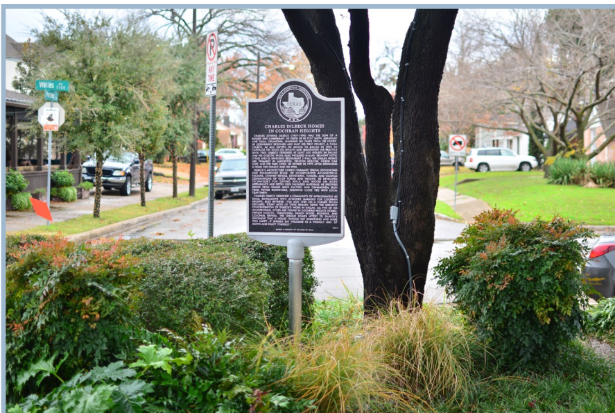
The Texas Historical Commissions plaque highlights Charles Dilbeck Homes in Cochran Heights.

Marker is property of the State of Texas