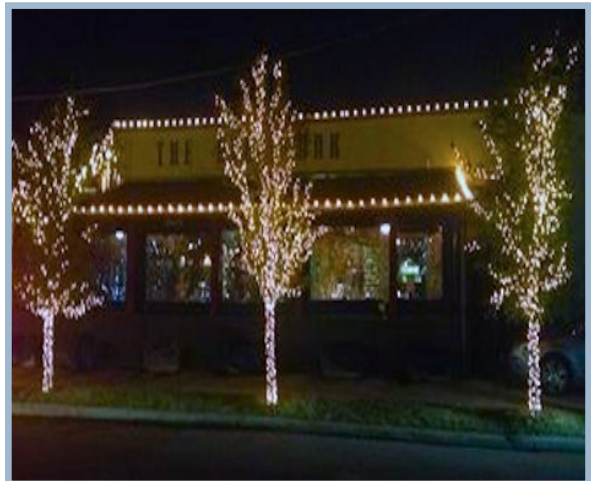
Holiday Decorations at the Old Monk On Henderson