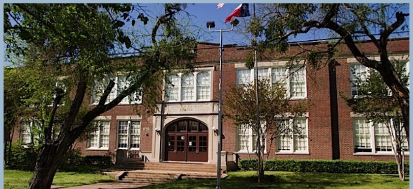
Bonham Elementary School on Milam Street

https://www.facebook.com/Solar-Preparatory-School-for-Girls-at-James-B-Bonham-1664000443881875/