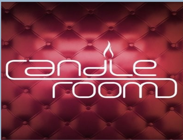
The Candle Room, located at 5039 Willis Avenue

Join your neighbors for the annual Cochran Heights Neighborhood Holiday Party! This year's event will be hosted by the Candle Room, located on Willis Ave from 7-9pm, tonight, December 18th.